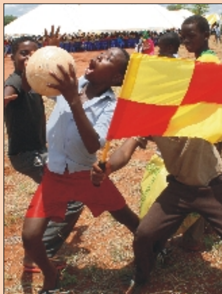
Time to play.....Kids playing during the recent Batho-Pele Day at Madimbo.