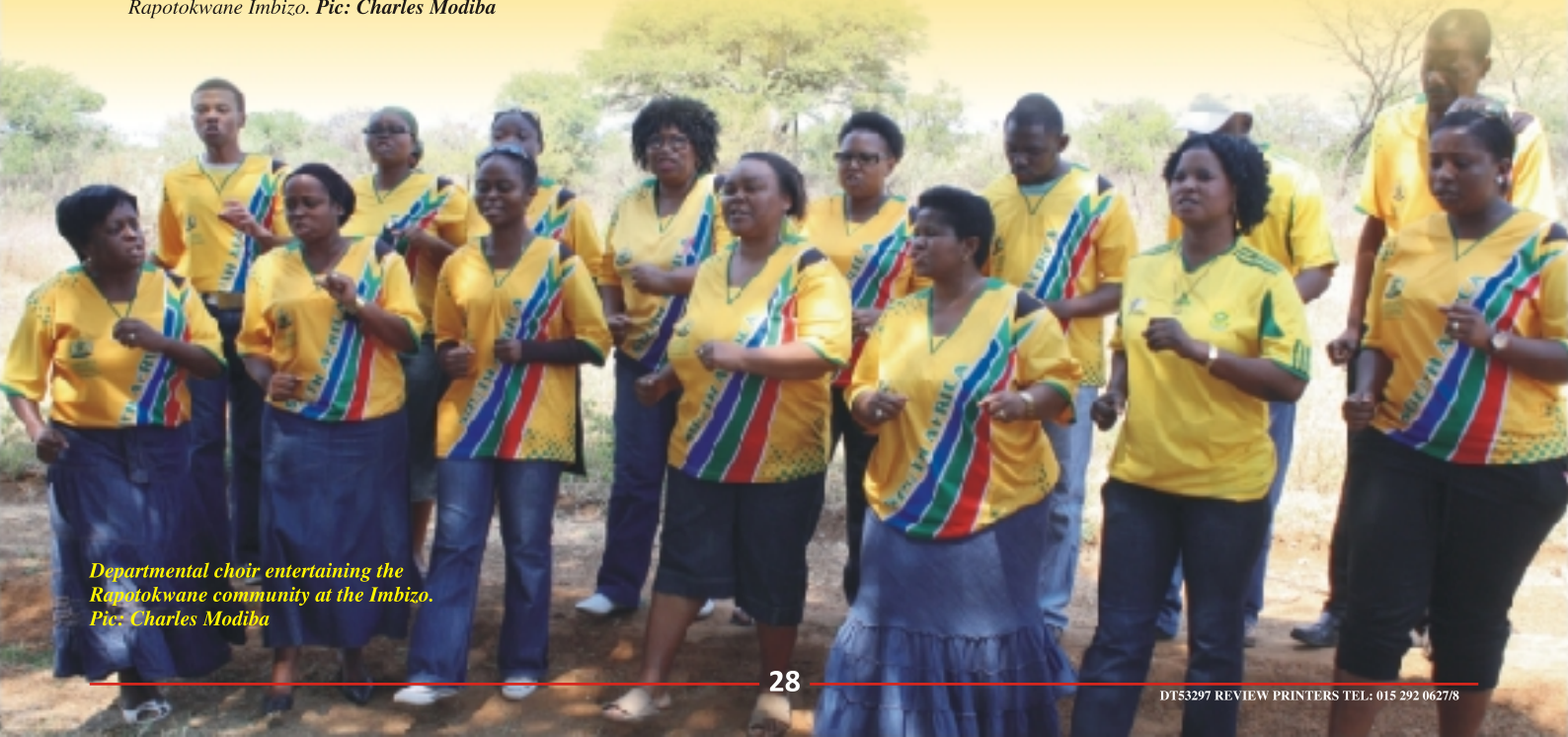
Departmental choir entertaining the Rapotokwane community at the Imbizo.