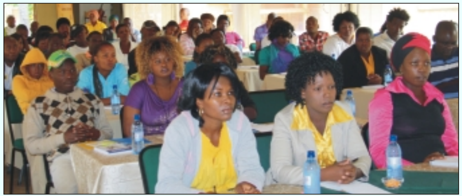
Future artists.....aspiring artists attending the Indigenous music workshop at Saint Marco Hall, Polokwane.

recently. IMPUCUZEKO is a Non Government Organisation Funded by National Lottery Distribution Trust Fund. Held at Saint Marco Hall in Polokwane, the workshop saw about hundred upcoming artists with a desire to be superstars turn up at the workshop which seeks to empower artists who want put indigenous music on the map. Each district of Limpopo, Mopani, Vhembe, Waterberg, Sekhukhune and Capricorn identified twenty future artists for the workshop that was facilitated by influential and experienced people in the music industry. Facilitators ranged from radio personalities, producers to recording companies.