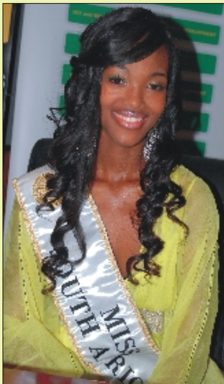
Beautiful in every sense..... A ray of sunshine in the morning, Miss South Africa Bokang Montjane