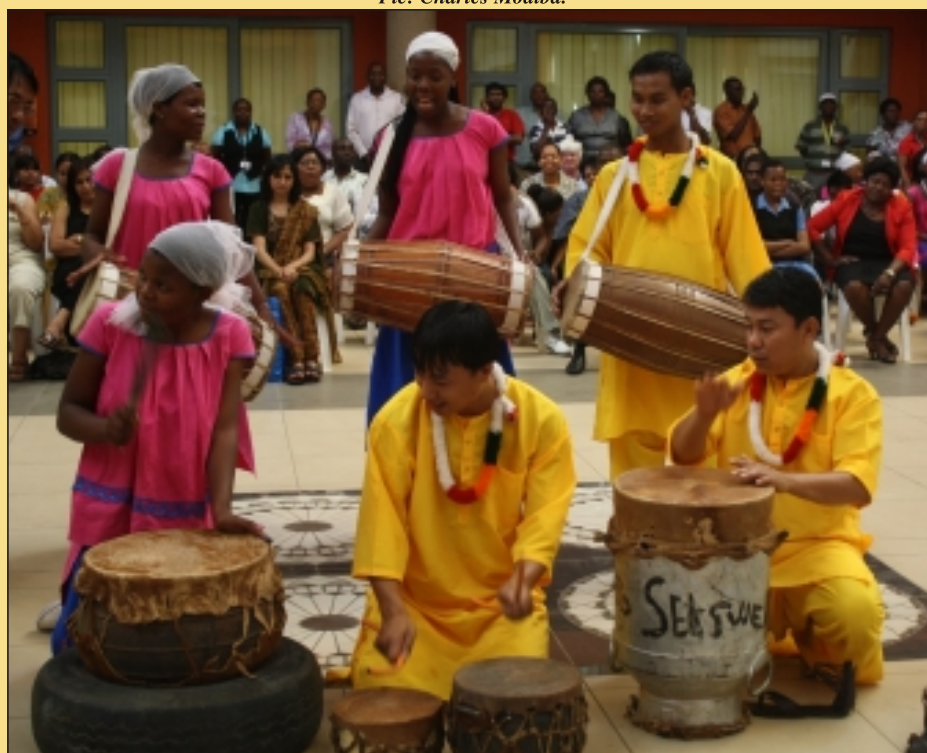
Cultural exchange on show as some cultural groups took interest in learning each other dances and drums.