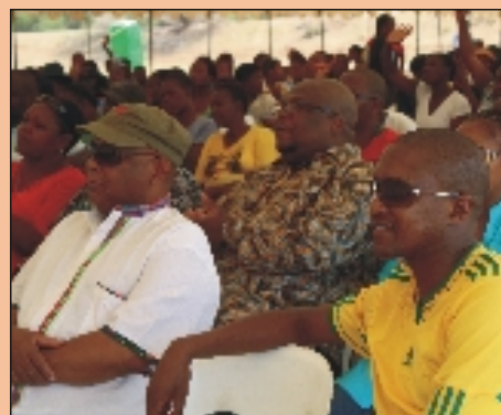
Reaching out.....Some officials of the department during the recent outreach programme at Rapotokwane.