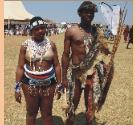
Highly cultured.....calling for an arts and culture centre in the Vlakfontein area.