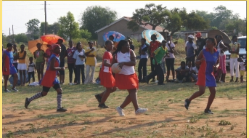
Departmental netball team playing the local team during the Imbizo.

opportunity to interact with local community by playing sport against Rapotokwane community. The sporting codes that were played during the day were Soccer, Netball, Volleyball, Ncuva and Tug of War.