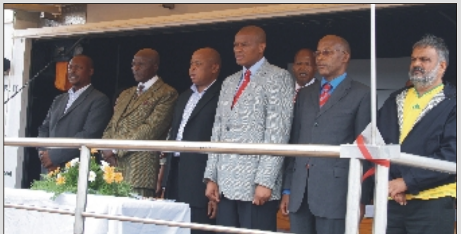
We are all here to listen.....leadership at traditional, local, district and provincial level during the Exco Meets the People at Muswodi.

Concerns came from all sides and ranged from health,