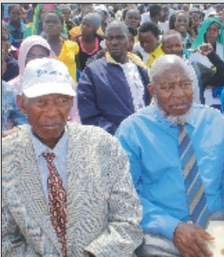
The people.....these citizens were at the Exco Meets the people at Muswodi, Mutale municipality in the Vhembe district.