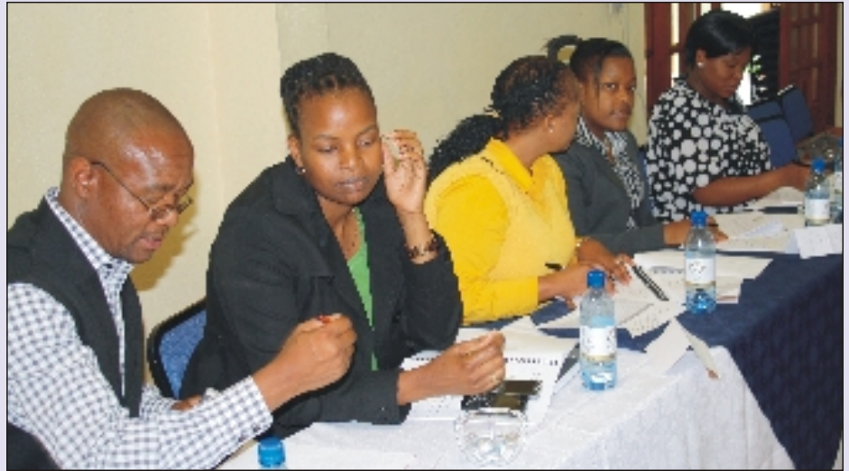
You can beat stress.....some officials getting the necessary tips on how to put stress at bay.

satisfaction and expressed: "I have figured out that poor time management can cause a lot of stress. When you are stretched too thin and running behind, it's hard to stay calm and focused. But if you plan ahead and make sure you don't overextend yourself, you can alter the amount of stress you're under," said Tebeila.