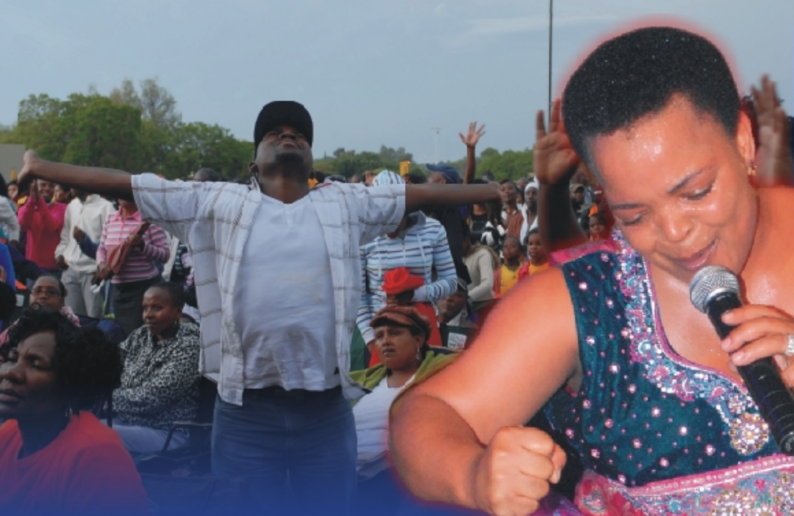
Appealing to the heavens.....These fans could not help it but give themselves up.