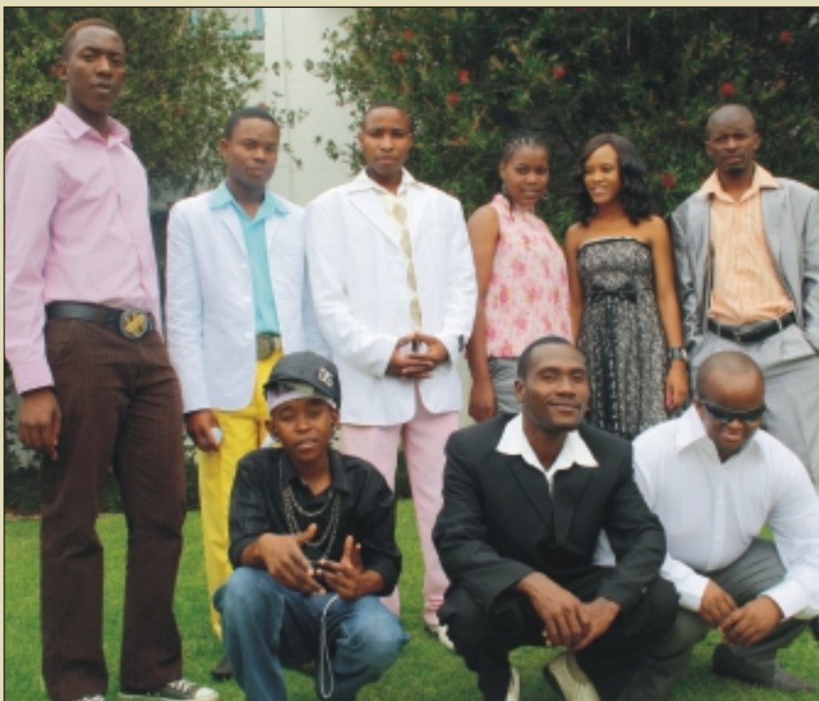
Talented.....the group that represented Capricorn district at the "I Can Sing" competition final.

performance at the second season of the "I Can Sing" grand finale guaranteeing the artist a top ten position and a recording contract to the tune of R125 000. The finals were at held at Landmark Lodge outside Polokwane where fifty contestants from the five district of Limpopo province - Waterberg, Mopani, Sekhukhune, Vhembe and Capricorn fought it out hoping to walk away with the promise of stardom.