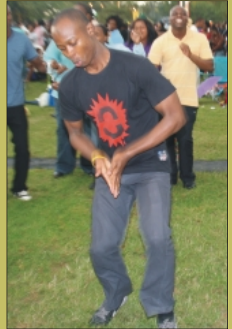
Dance master.....a fan hard at it during the festival.