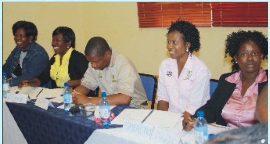
Laughing it off.....Some of the officials who attended the stress management workshop.

their time effectively value their time immensely. To drive this point home, officials were given work related case studies to ascertain if they understand time management.