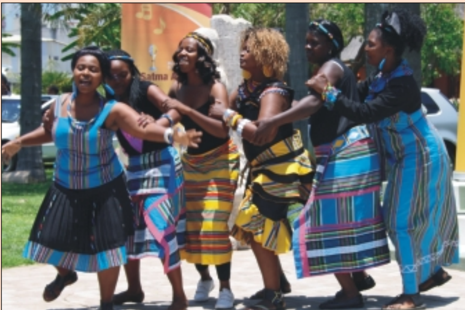
Winners.....Ndevhe ya Tsini performing at the Indigenous Music competition at Saint Marco Hall in Polokwane.

work, passion and dedication. It also shows that you love what you are doing and most importantly enjoy music. You are good individually and better collectively," said the HoD adding that the winners should not forget where they come from when they become famous music stars.