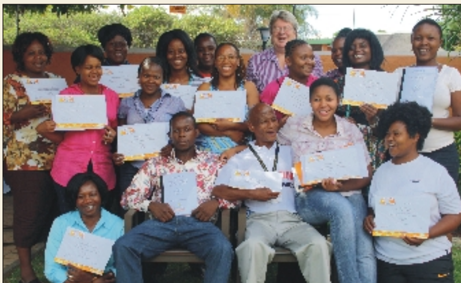
Information protection.....Officials of the department after successfully completing a workshop on Counterintelligence and Information Protection Awareness.

sessions were issues such as safe document handling, classification of information, telephone requests, foreign travel and how to protect the information while out of the office.