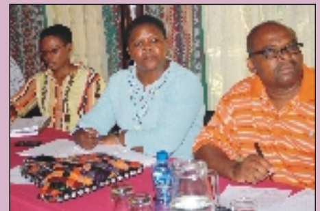
Getting the lowdown.....Some of the managers at the IDP workshop.