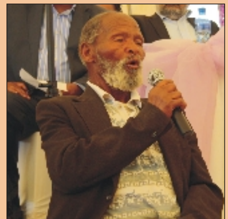
Raising his concerns.....Vlakfontein community member telling the leadership of the province his service delivery concerns during the recent Exco Meets the People.

In summarizing the day proceedings, Limpopo Premier Cassel Mathale who led his Executive Council to Vlakfontein village encouraged community members to tell the leadership what they want to see happening in their communities. "The power is in your hands. We serve you. We are in our respective offices on your behalf. Speak without fear about anything," emphasized Mathale.