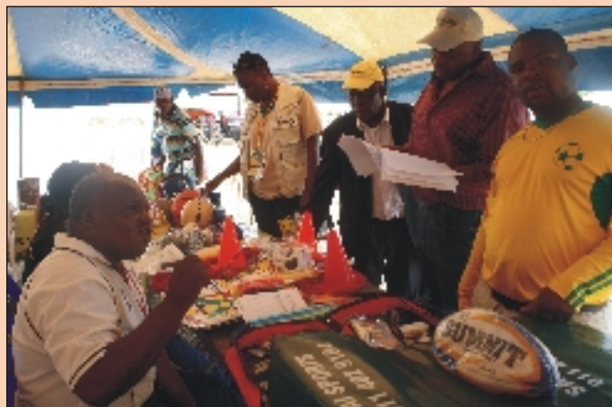
Exhibition time.....official of the department explaining to the people visiting the stall.

Meaning that servants of the people must be available at all times to assist people with information that is needed and offer advices when requested.