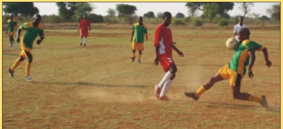
Silky skills.....football was also enjoyed by those who have passion for it as seen here.