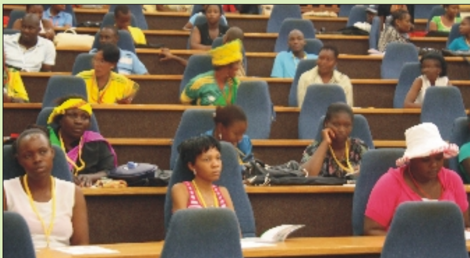
It starts with us.....Some of the lovers of heritage attending the Indaba.

developed and presented for those purposes in a way that ensures dignity and respected cultural values, citing examples of Mapungubwe heritage site which attracts many tourists from around the world.