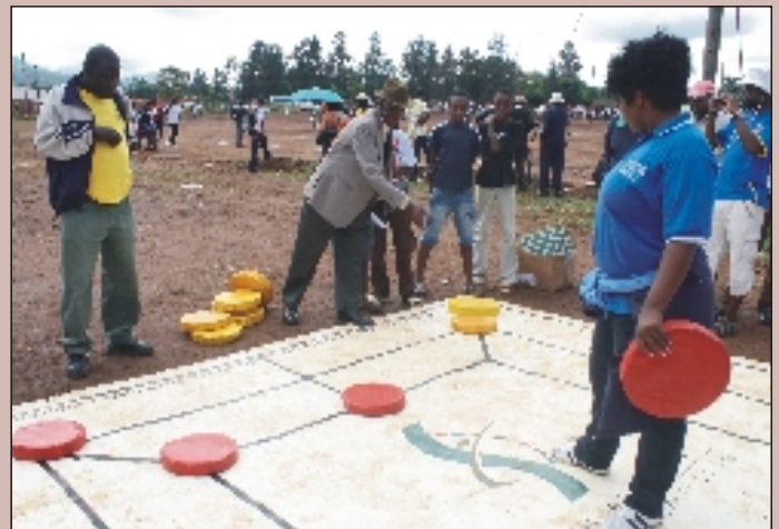
Better move.....