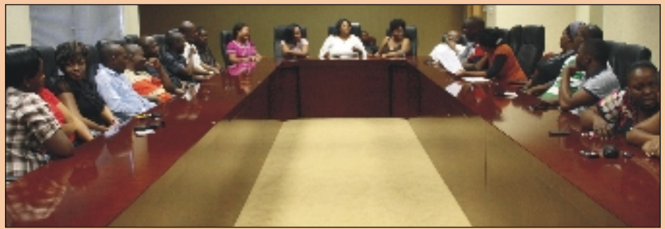
Taking interest.....some staff members at the workshop.