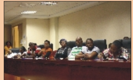
Attentive.....staff members attending the workshop.

to stress, high blood and other conditions. She said that employees should review their finances to check if they are not over indebted as this will help them to reduce unnecessary expenditures. "When you are over indebted, pay your smallest outstanding balance