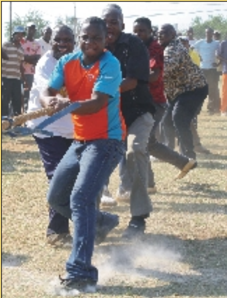
Who is stronger.....Tug of war formed part and parcel of the activities at the Rapotokwane Imbizo.

Government officials from the department had an