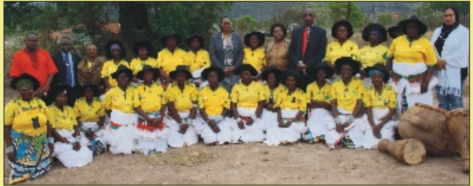
Cultural and leadership ensemble.....gracing the site where the library will be built.