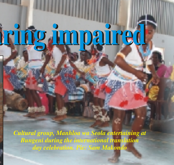
Cultural group, Manhloa wa Seola entertaining at Bungeni during the international translation day celebration.