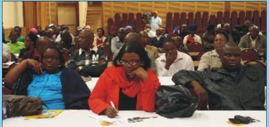
Taking interest in name change should be part and parcel of our daily living.

Community members attended the conference in large numbers to ensure that they form part of naming process in their areas.