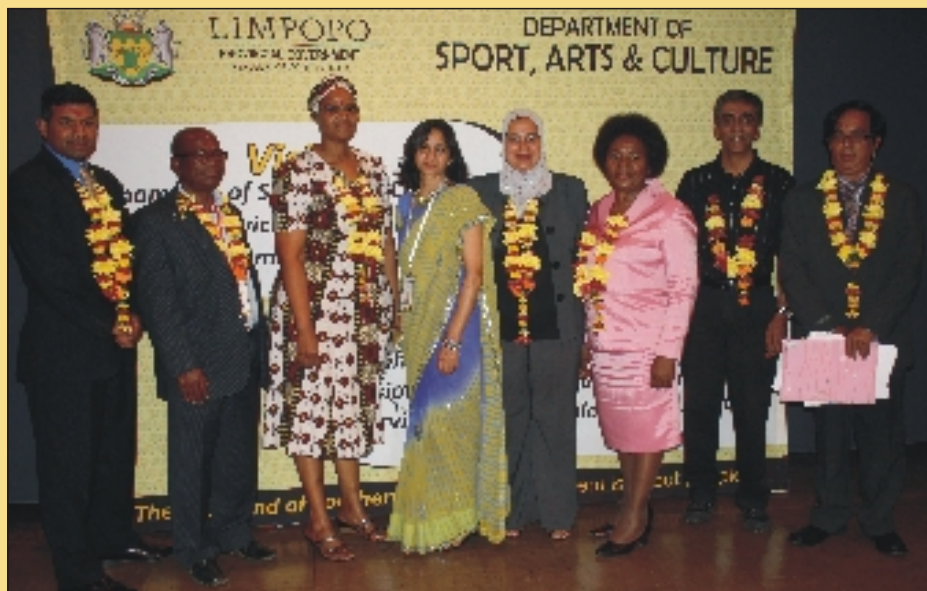
Spear headers of culture in India and Limpopo.